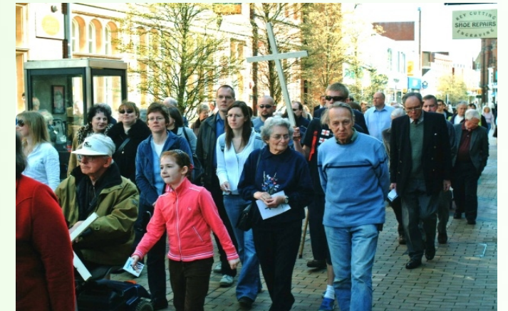
Good Friday Walk of Christian Witnesses