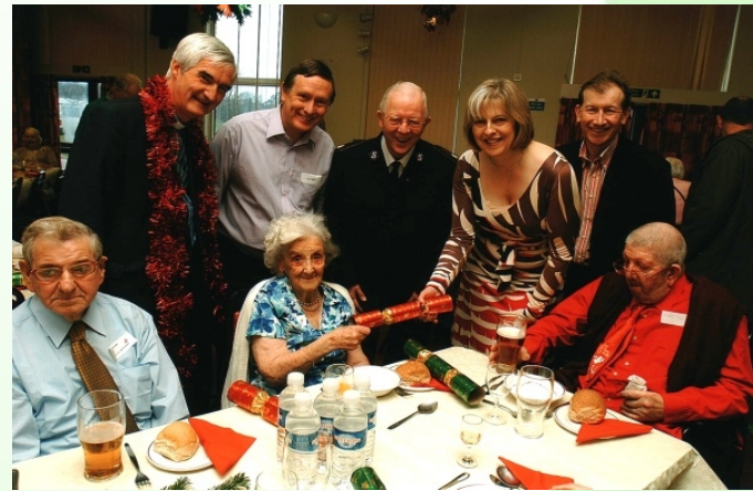
Churches Together in Maidenhead Christmas Lunch